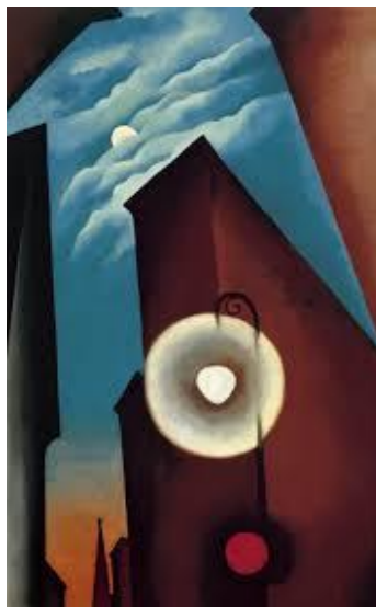
Georgia O'Keeffe 'New York Street with Moon' 1925