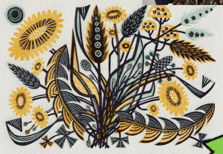
Angie Lewin 'Dandelion Track II' Wood engraving

ANGIE LEWIN: After working in London as an illustrator she studied horticulture and a move to Norfolk prompted a return to printmaking. Inspired by both the clifftops and saltmarshes of the North Norfolk coast and the Scottish Highlands, she depicts these contrasting environments and their native flora in wood engraving, linocut, silkscreen, lithograph and collage. These landscapes are often glimpsed through intricately detailed plantforms. Still lives often incorporate seedpods, grasses, flints and dried seaweed collected on walking and sketching trips. Lewin designs fabric and stationery for St.Judes and Liberty.