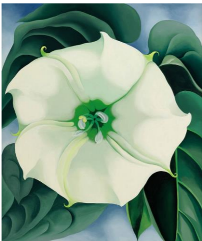
Georgia O'Keeffe 'Jimson Weed/White Flower No.1' 1932 Sold for $44 in 2014 - a world record for a female solo artist