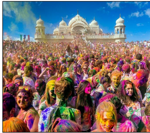
Image of Holi festival, celebrating the start of spring. People smear each other with colours.

Hinduism does not have one holy book, but several sacred texts. Mandirs are Hindu worship buildings.